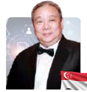
Dr. K C Chan Wholistic Innovation of Lifelong Learning (WILL)